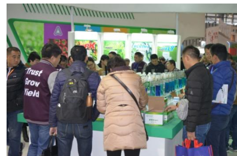
The RLF booth and products

As a global leader in liquid fertilisers, RLF established its display at the Fair with many different products on display for participants and visitors to see and evaluate. These products were :