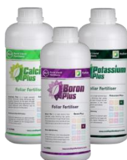
Potassium Plus Calcium Plus Boron Plus