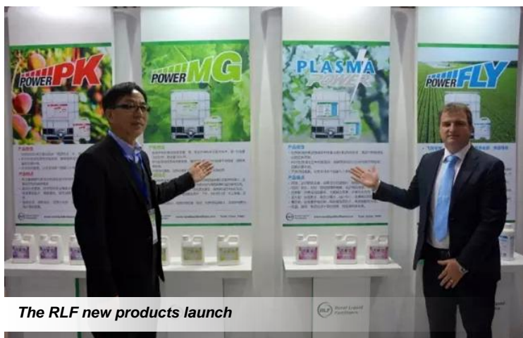
The RLF new products launch

The RLF staff team all worked enthusiastically during the Fair and gave detailed introductions and explanations as to the benefits of the wide range of specialty products. It was very satisfying indeed to receive the number of enquires and appreciative comments from many consultants.