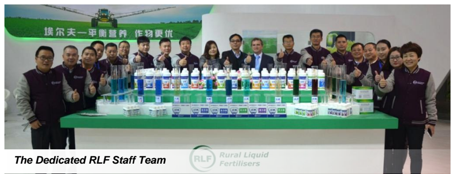
The Dedicated RLF Staff Team

The Plant Protection Information Exchange Conference came to an end after two very successful days for RLF. The staff team all came away with the feeling that the era of Specialty Fertilisers has arrived !