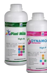
Plant Milk-High N Plant Milk-High K Dynamo-High N Dynamo-High P Dynamo-High K