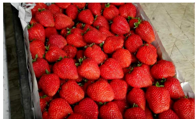
Strawberries ready for market

As can be seen, the strawberry he planted appears large and healthy looking with even, bright colour. The taste was good also.