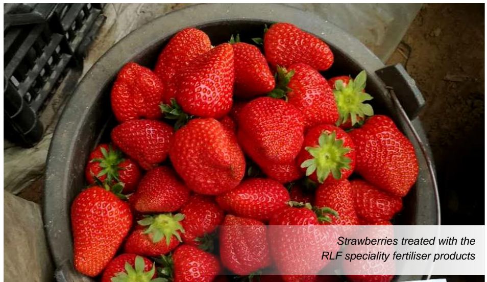
Strawberries treated with the RLF speciality fertiliser products