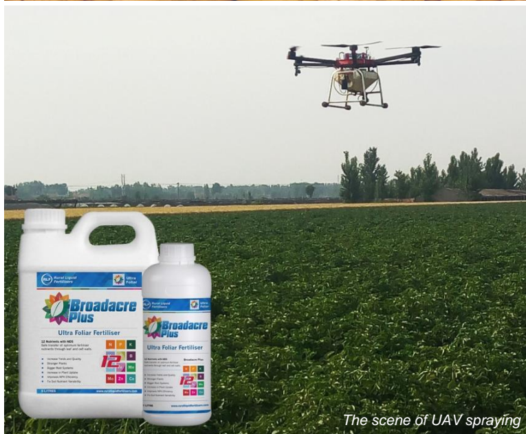
The scene of UAV spraying