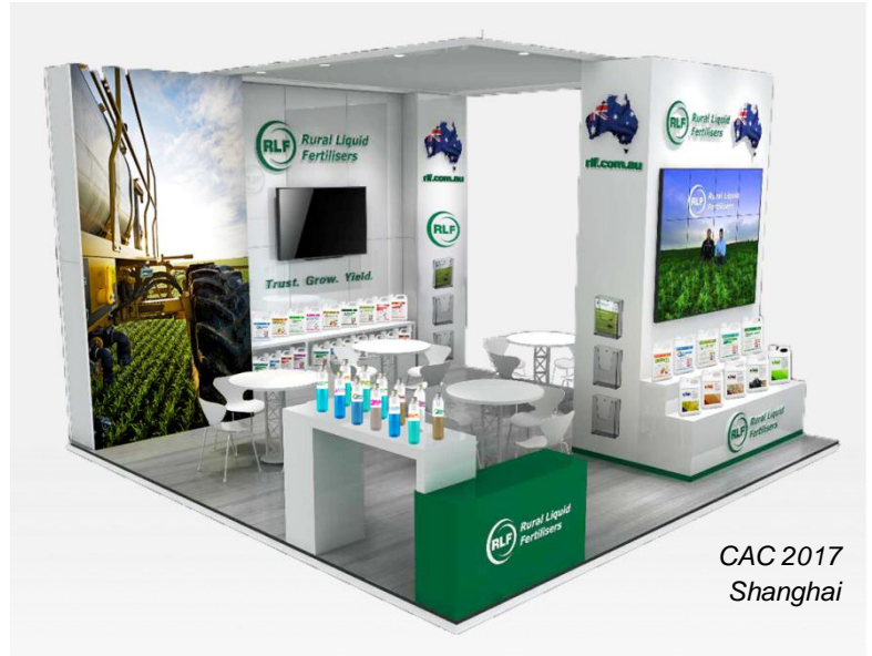
CAC 2017 Shanghai

CAC is the world's largest agrochemical exhibition and integrates new product display, technical exchange and trade talks. It therefore becomes the world's largest one-stop shop for active participation in international agricultural trade and cooperation at all levels of the industry. Not only does it feature fertilisers, pesticides, seeds, crop protection equipment, production and packaging equipment and logistical support services, but provides real opportunity for innovative discussion and exchange for future developments that will support the goals and desired outcomes for the global agricultural industry as a whole.