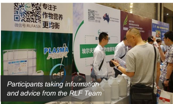
Participants taking information and advice from the RLF Team