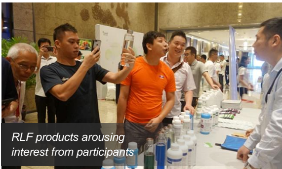
RLF products arousing interest from participants