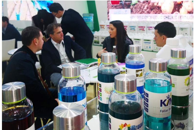
CAC 2018, Shanghai

Because of the prestige and importance of this international trade expo, RLF will once again introduce new products to the market as it expands and renews its specialty liquid fertilisers. This is always an exciting time for the Company as it rises to meet the challenges faced by its customers, particularly those within the Asia region marketplace.