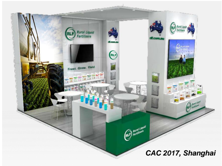
CAC 2017, Shanghai

CAC is the world's largest agrochemical exhibition and integrates new product display, technical exchange and trade talks. It therefore becomes the world's largest one-stop shop for active participation in international agricultural trade and cooperation at all levels of the industry. Not only does it feature fertilisers, pesticides, seeds, crop protection equipment, production and packaging equipment and logistical support services, but provides real opportunity for innovative discussion and exchange for future developments that will support the goals and desired outcomes for the global agricultural industry as a whole.