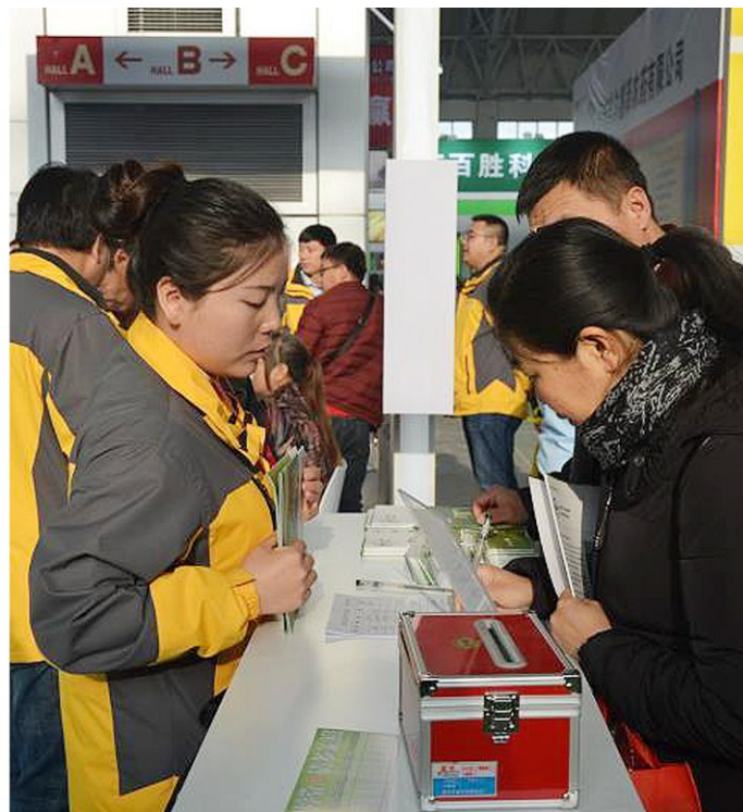
RLF booth at the conference site