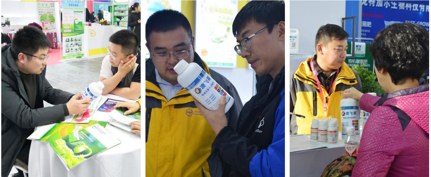
Visitors discussing the Flight Defence Star Product

Flight defense is undoubtedly a 'hot phrase' in agriculture, especially in the field of plant protection in 2018. The rapidly growing Northeast plant protection UAV market has brought new ways to increase farmers' production. More and more farmers feel and accept the innovation brought by science and technology to the planting and growing industry. As a special foliar nutrition product for flight defense, RLF Broadacre Plus naturally attracted great attention at the exhibition site.