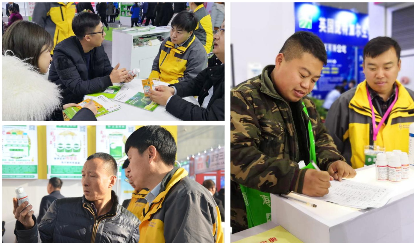
Visitors discussing the Seed Star Product

BSN Superstrike has been available in China for 10 years, and it has been verified to be safe and effective in nationwide planting trials.