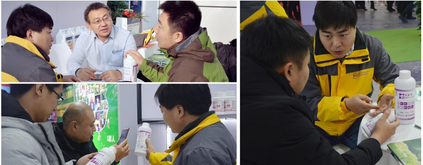
Visitors discussing the Phosphate Potassium Star Product

RLF PowerPK has a phosphorus content of 232g/L and a potassium content of 426g/L. The high content of phosphorus and potassium elements synergises with biologically active factors to effectively resist the bad weather and meet the demand for phosphorus and potassium of crops.