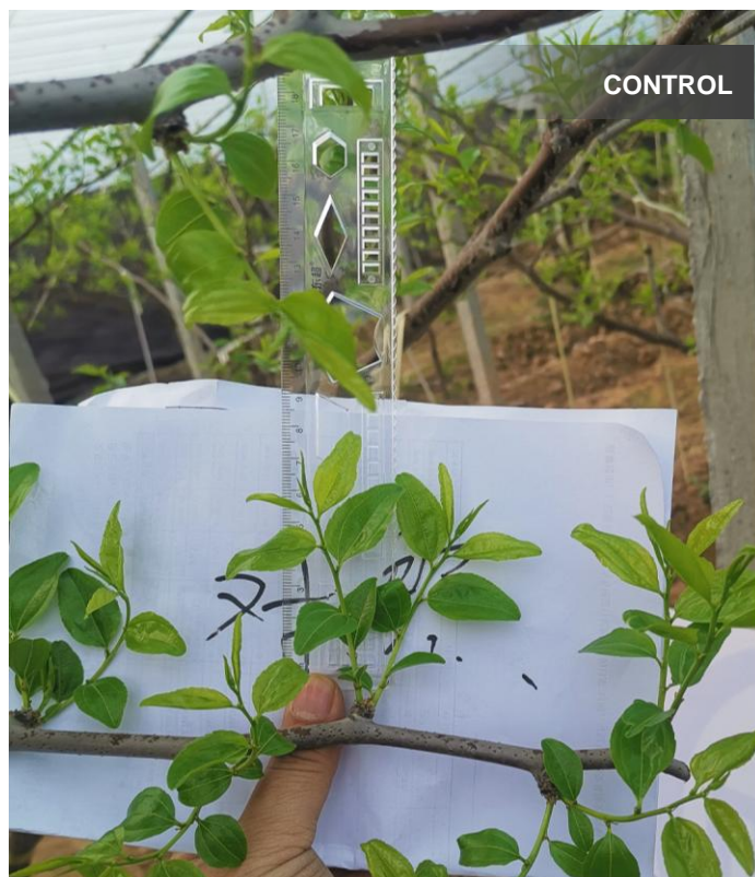
New shoot length is approx. 6cm