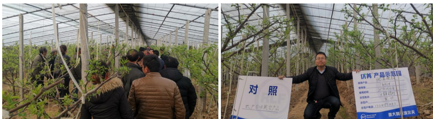
The growing shed and the grower who undertook the trial

What they observed were plants that were full of vitality and awash with green buds.