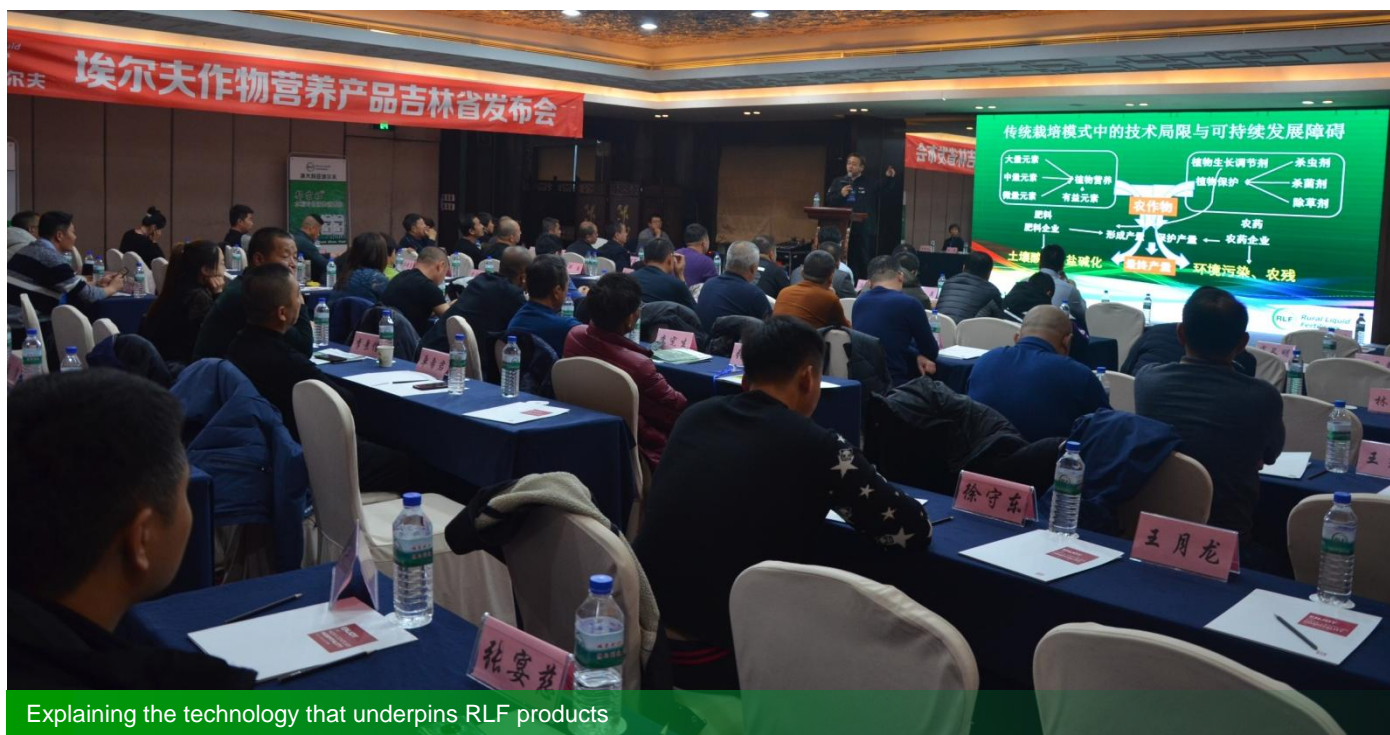
Explaining the technology that underpins RLF products

The RLF Technology Team has conducted a large number of professional tests throughout the country. Many cases and examples, including cucumber downy mildew, tomato gray mold, wheat yield increase, crop protection with flight control, and so on were shared at the meeting. The test data was analysed and the test results were compared to ensure that the solution could maximise the benefits to the growers.