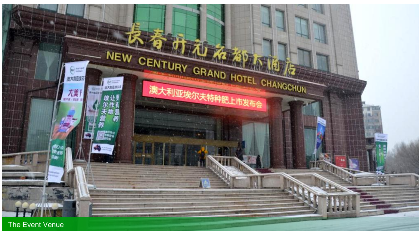
The Event Venue

Nearly 100 dealers and distributors gathered together to participate in this grand event, despite the cold, snow and wind that was experienced on the day.